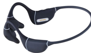
Smart wearable industry